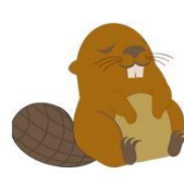
Never Give Up