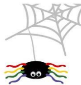
Keep on Improving