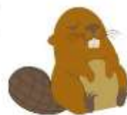
Never Give Up