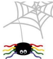
Keep on Improving