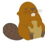
Never Give Up